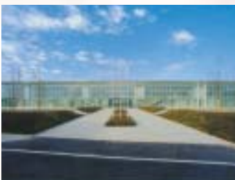
Akebono Crystal Wing in Hanyu, Saitama Prefecture

Akebono Crystal Wing in Hanyu, Saitama Prefecture, completed by Maeda in November 2001 and now used as a research institute and office building by Akebono Brake Industry Co., Ltd., won the Building Contractors Society's 44th annual BCS Prize.