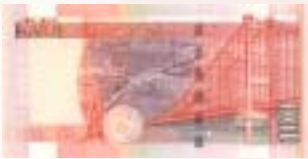
New Hong Kong $100 bill

The images of the Kap Shui Mun Bridge and Ma Wan Viaduct, which Maeda designed and built, were selected to be depicted on the back of the new Hong Kong $100 bill. The road and rail bridge and viaduct, connecting the Hong Kong International Airport with the North Lantau Highway heading northeast and the Airport Express Line, are extremely important and familiar to the people of Hong Kong. Completed in May 1997, the upper level of the two-tiered construction supports separate three-lane roads (total: six lanes), and the lower level is equipped with two rail lines.