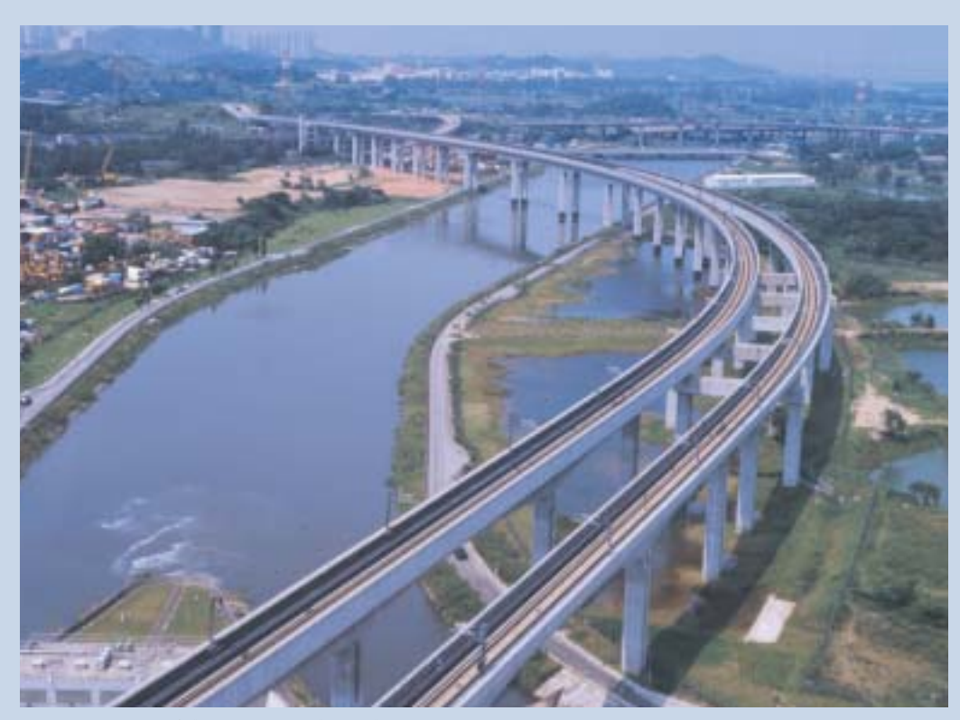
Construction of the West Rail Viaduct (CC201)

Maeda was contracted by Kowloon-Canton Railway Corporation to build an approximately 5.6-kilometer doubletrack viaduct as part of a project to construct the 30-kilometer West Rail line. At the time of receiving this order, close attention was being paid to reducing construction time and cutting costs. Maeda has a proven record in constructing viaducts in Hong Kong, and the Company's unique technologies are highly regarded by the client.